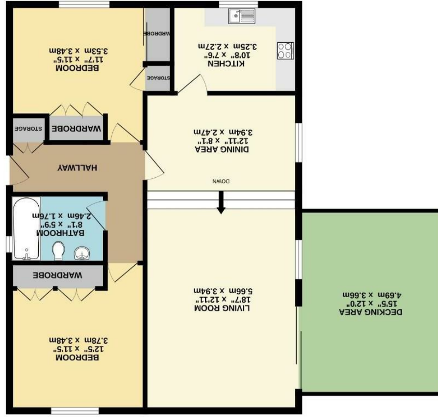
GROUND FLOOR 831 sq.ft. (77.2 sq.m.) approx.

TOTAL FLOOR AREA: 831 sq. ft. (77.2 sq.m.) approx. Measurements are approximate. Not to scale. Drawing purposes only. Made with Magicplan.com